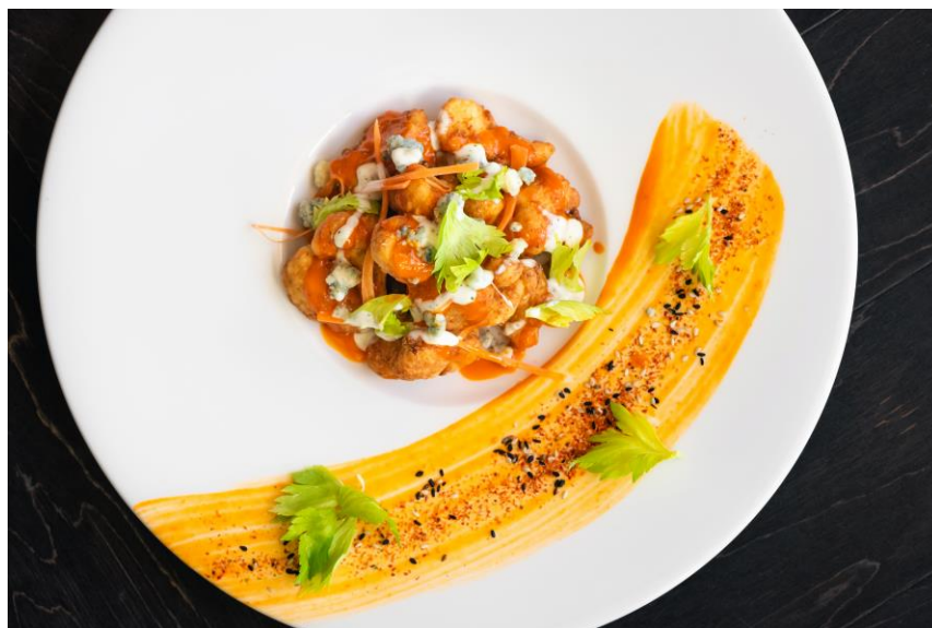
Kentucky Fried Cauliflower

Chef Suzuki's all-day menu includes such items as Pork Belly Lettuce Wraps with housemade kimchi and fermented pepper aioli; Kentucky Fried Cauliflower with blue cheese, shaved carrots, celery leaf, and house buffalo sauce; and the Asparagus Experience made with asparagus purée, tofu mousse, prosciutto, crusty country bread, soft boiled egg, and tempura asparagus tips. For those seeking out something more substantial, SX Sky Bar also offers Duck Confit Carnitas with avocado salsa verde and apple and radish slaw; and Baja Fish Tacos made with tempura-fried fish, charred salsa, cabbage slaw, and a lime and cilantro crème.