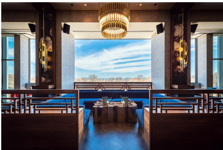
SX Sky Bar Hi-res images are available here .

Bi-level restaurant and lounge overlooking Grant Park now open in Chicago's South Loop