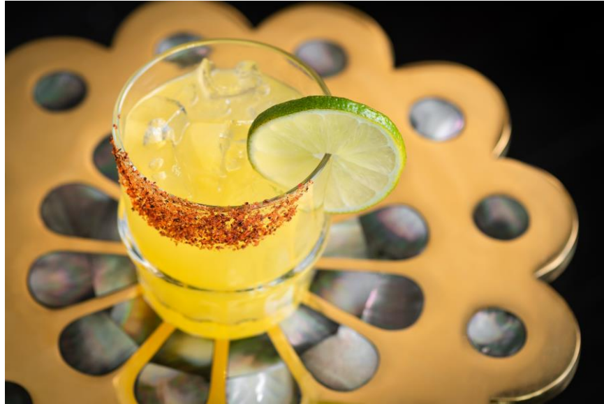
The Big Heat

SX Sky Bar's imbibing guests can choose from a variety of craft cocktails, beer, wine, and spirits. Guests can expect tasteful twists on classic drinks – like the SX Old Fashioned made with rich demerara syrup – as well as signature drinks, such as The Big Heat comprised of Casamigos Blanco tequila, passion fruit purée, lime, and firewater bitters; or the Agent Provocateur made with Remy Martin VSOP, pear liqueur, peach, and lime.